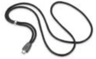
(neck cord design may differ slightly)