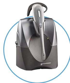
CS60 flexible, cost-effective, convenient