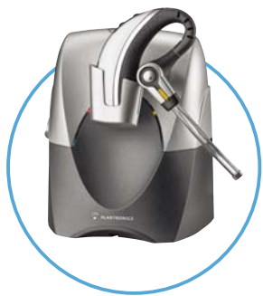
CS70 the executive choice

If you've ever tried to cradle a telephone between your shoulder and your ear, in order to hand-write or key in some notes, you may not need much of an answer to the question – 'why go wireless?'. At Plantronics we believe you should be able to talk whenever, however and wherever life takes you. These days, that might be the other side of the world, but it's just as likely to be the other side of the office. Enjoy your newfound freedom.