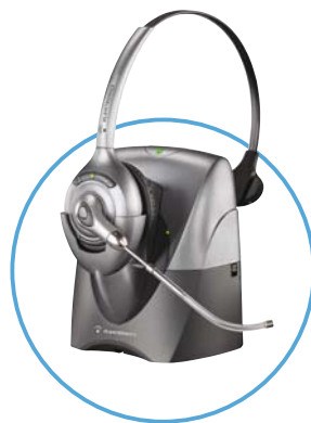
SupraPlus™ Wireless if you're on the phone most of the day