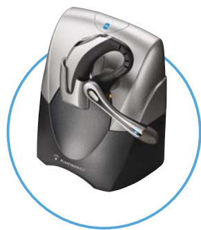
Voyager™ 510 System use it with your office phone and your mobile

In that time, we've supplied headsets for people travelling to the moon, so you're in good hands.